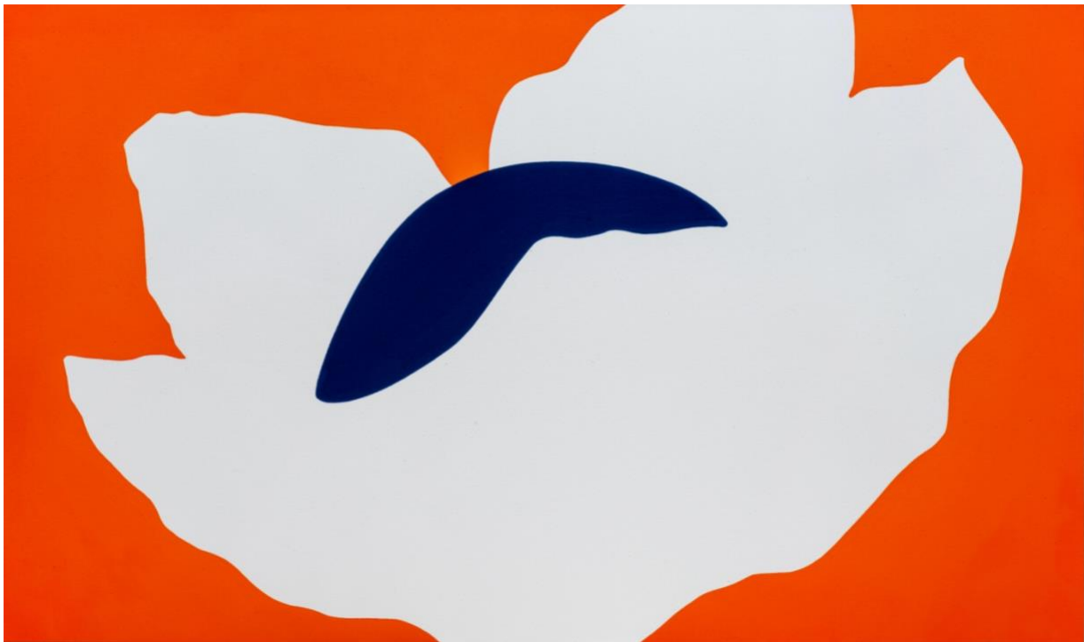
Paul Kremer, Bloom 24 , 2024, acrylic on canvas, 32 x 54 inches

BG: Although the subject matter of the paintings is fairly diverse, plant forms, particularly florals, are a recurrent theme in Straight Loops . In your Mother series, you chose to incorporate flowers both for their formal similarity to eggs and their symbolic relation to maternity, but botanicals are also present in your Bloom , Exchange , and Set series—just to name a few. Why the draw to botanicals over other forms?