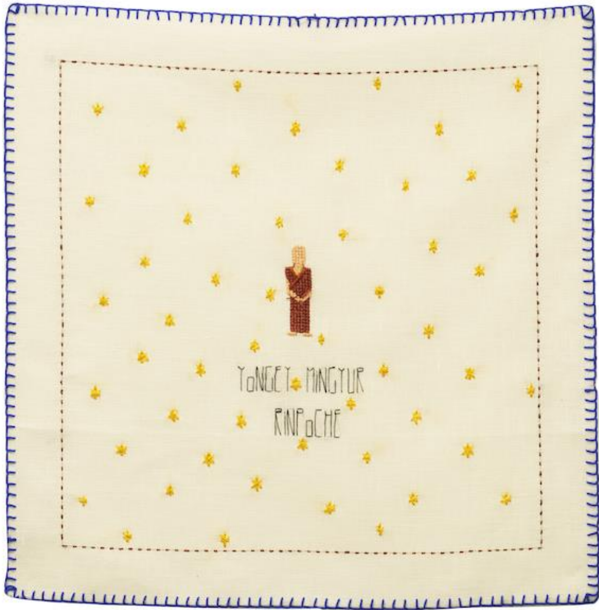
Elsa Hansen - Yongey Mingyur Rinpoche, 2023. Silk, velvet and gold hand embroidery on linen; 13 x 13 inches