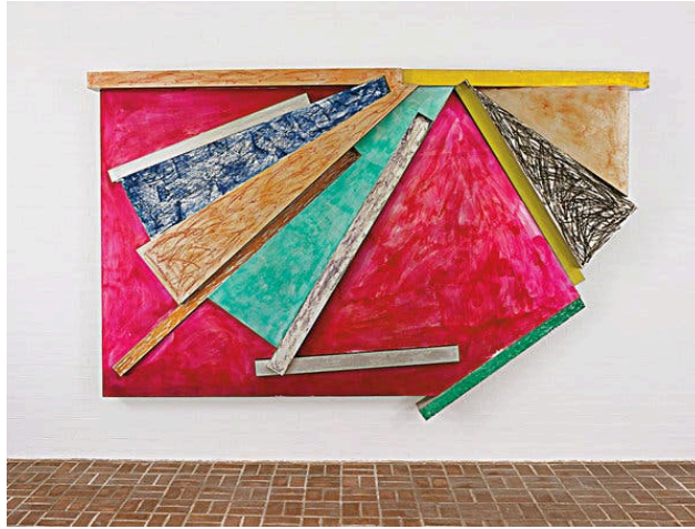
Stella's "Grajau I" (1975).

If entropy is the natural direction of all things — the laws of physics, anyway, as well as contemporary art — some things in our universe do, in fact, remain constant: Stella's star, at least, built on the principles of space, light, speed and seemingly infinite expansion, is unlikely to dim from art history anytime soon. "Basically, everything is about being an artist," he says as we part ways. He pulls out a cigar as I thank him and gather my coat and umbrella. "You're welcome," he smiles. "And don't say anything about the smoking."