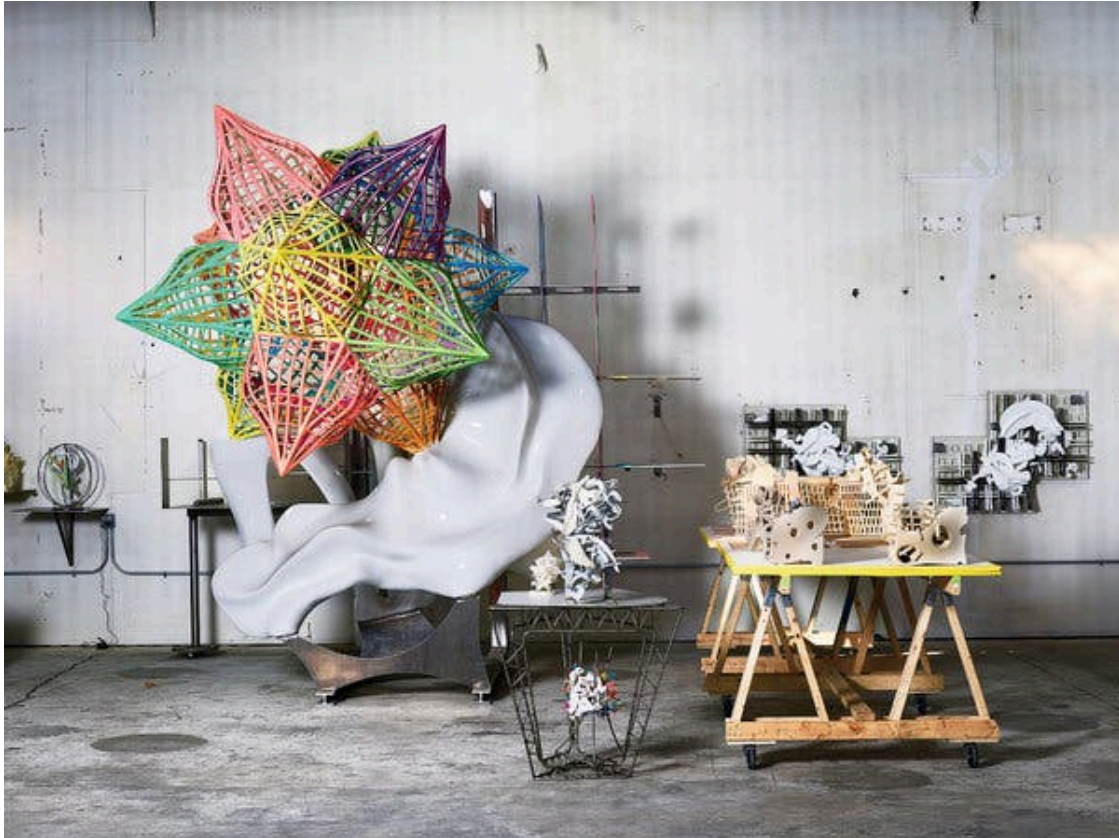
Recent works in Stella's studio, including "Nessus and Dejanira" (2017, left) and "Four Piece Table Sculpture" (2019, center). The artist's new show is dedicated to his long exploration of star-shaped geometrics. Left: Frank Stella, "Nessus and Dejanira," 2017, aluminum and fiberglass © 2020 Frank Stella/Artists Rights Society (ARS), New York. Center: Frank Stella, "Four Piece Table Sculpture," 2019, RPT and steel © 2020 Frank Stella/Artists Rights Society (ARS), New York

Unlike many mid-20th-century artists who rose fast only to seemingly collapse under the pressure of their own reputations, Stella kept pushing himself by using new forms, materials and technologies. When he felt he'd reached the limits of the flat canvas, he built out from it in reliefs inspired by "Moby-Dick" and Polish villages. In the 1980s and '90s, he made metal sculptures that looked like race cars or jet engines turned inside out, as well as unwieldy canvases covered in Pop-colored riots of form — operatic assemblages of cones, pillars and graffiti-like brushwork, like something Charlie Sheen 's character might have had in his home in the 1987 film "Wall Street." That the godfather of Minimalist painting turned into a progenitor of the contemporary baroque has always flummoxed critics.