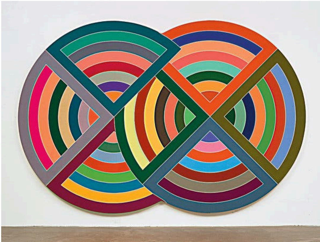
Stella's "Firuzabad" (1970).Credit...Frank Stella, "Firuzabad," 1970, synthetic polymer paint on canvas, digital image © The Museum of Modern Art/Licensed by SCALA/Art Resource, N.Y. © 2020 Frank Stella/Artists Rights Society (ARS), New York

"THERE'S AN ELEMENT of luck and things like that to it, but the fact of the matter is that the system was pretty supportive," says Stella when I remark on how he seemed to be exactly the right artist at exactly the right time. In New York, he was granted a sense of license to do whatever he wanted with paint, inspired by the artists he revered, among them Willem de Kooning , Barnett Newman and Pollock. Stella found his own canvases growing larger — large enough to have to be placed on the floor. "They were no longer easel paintings," he says. "Basically, I was standing up in front of a painting that was a little bit bigger than I was, and that was the working on it, like the way you would paint a wall in a house. And that was the kind of thing that I felt comfortable with." He singles out the abstract painter Helen Frankenthaler , who studied under Hofmann, as the artist he believes was one of the most undervalued in her lifetime. "They were always interesting, always good, and very, very difficult paintings she made, and she was lucky if she could sell any of them," he recalls. Early in his career, she proposed a trade with him, but he was too intimidated to take her up on it.