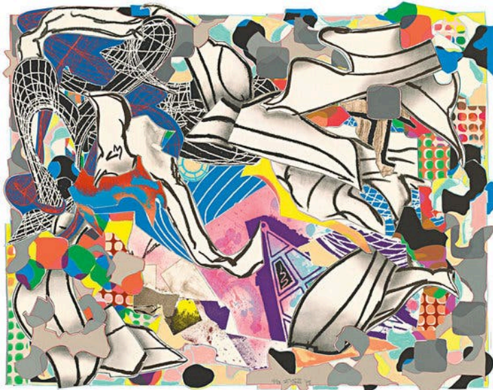
Stella’s “Ambergris” (1993).

A story in one of his mother’s Vogue magazines, featuring models posed in front of a painterly Franz Kline -esque Abstract Expressionist backdrop, provided him with an early clue that art wasn’t only about figuration. At Phillips Academy in Andover, Mass., in the early ’50s, when European abstraction was a prevailing force in studio art, Stella was especially influenced by the work of Hans Hofmann , a kind of proto-Abstract Expressionist from the ’40s, and the Bauhaus color theorist Josef Albers . “I had no mimetic ability,” Stella tells me, “but I was never interested in finding one, or cultivating one. No, I worked directly with the materials, actually. The big deal in postwar American painting was ‘its materiality,’ and so that was heaven for me.”