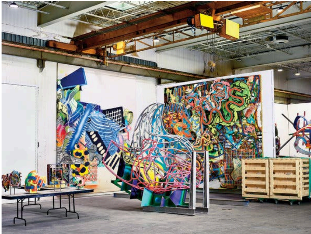
More works in Stella's studio, including "Hercules and Achelous" (2017, center).Frank Stella, "Hercules and Achelous," 2017, aluminum © 2020 Frank Stella/Artists Rights Society (ARS), New York

Star polygons have long been bound up with all sorts of human metaphysical projection, used as religious symbols and in ranking systems. As motifs associated with honor and glory and jobs well done, they decorate everything from national flags and sheriff's badges to toilet-training charts. But most of all, they symbolize the limits of human understanding, their geometric representation inseparable from their existence as celestial objects, luminous spheres of gas held together by their own gravity. Their lyricism aside, stars are our most archaic form of navigation as well as our best clues to the dimensions of the universe. Because light travels at a finite speed, the glow of a distant star is perceived by our earthbound eyes long after it has ceased to exist. Similarly finite, perhaps, is the rate of human understanding: In art history, we're continually revising the past based on our relative position to it; the importance of an artist or an entire movement might become visible only in retrospect. So what, one wonders, is left to say about a man who has been famous now since the 1950s, and all the more so at a time in which figuration and portraiture have made comebacks, and when we're all questioning art's relevance in a scary new decade?