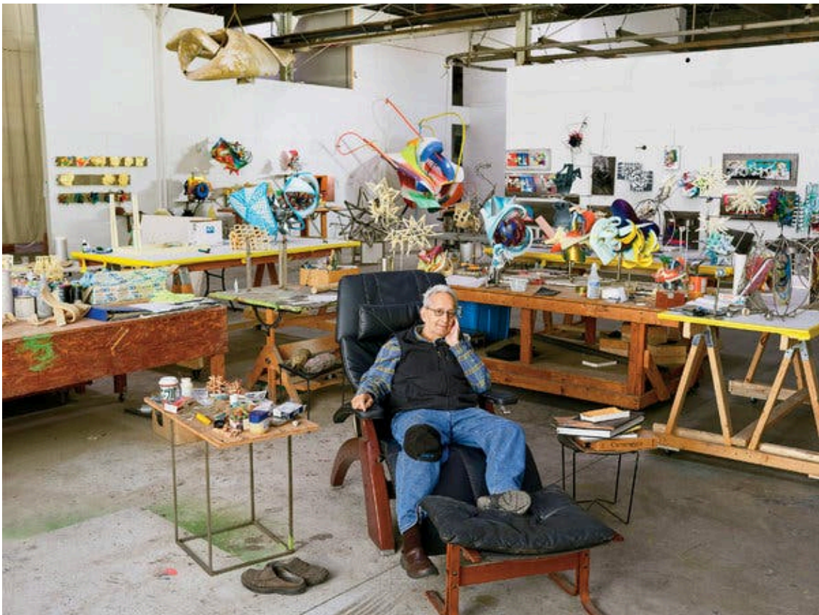
Frank Stella in his studio in upstate New York, photographed on Dec. 18, 2019.