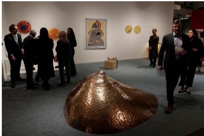
"Le Sein," by César Baldaccini, is one of the art pieces drawing a lot of attention at the Fog Design + Art fair in the Fort Mason Festival Pavilion.